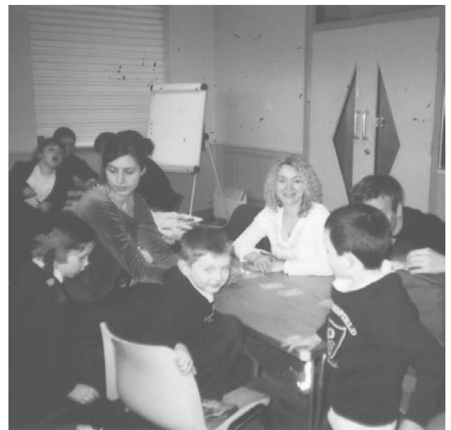
A day at after schools