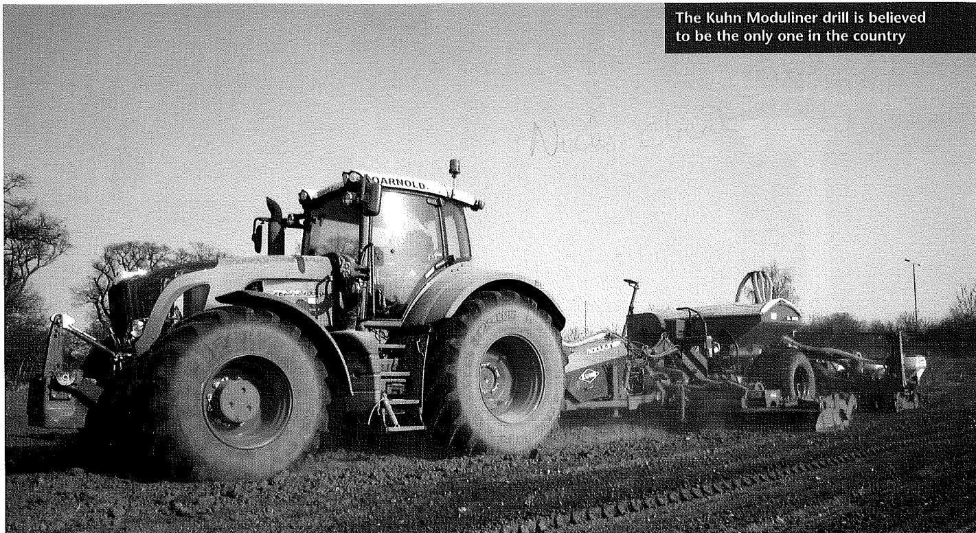
The Kuhn Moduliner drill is believed to be the only one in the country