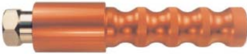
The Flexible Lance Safety Guard - Easy Installation of Lance Stop