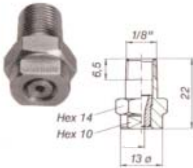
Series 550, weight: 13 g