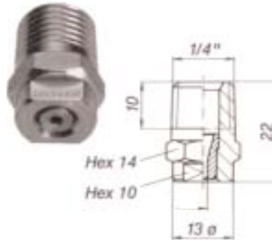
Series 546, weight: 18 g