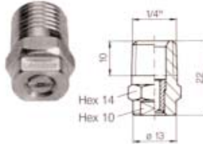
Series 602, weight: 18 g