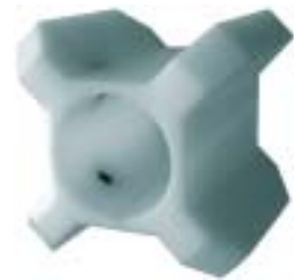
GO 075 Centralizer One Piece Plastic 3", or 4.5" Diameter