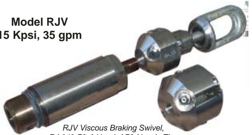
RJV Viscous Braking Swivel, RJ 043-P2-6 Head, AP2 Nozzle Tips BJ 045 Pulling Ring, and optional RJ 044-P4-6 Head, APF4 Nozzle Tips

RJ 043-P2-7 Nozzle Head 15° port for unplugging