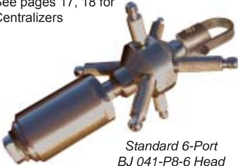
Standard 6-Port BJ 041-P8-6 Head HC 090 Pulling Ring SA 356-P8P4 Extension Nipples AP4 Nozzle Tips

Uses extension nipples for bigger diameters See pages 17, 18 for Centralizers