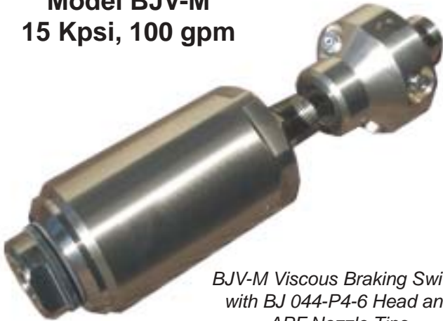
BJV-M Viscous Braking Swivel with BJ 044-P4-6 Head and APF Nozzle Tips

Use the biggest, most powerful jets possible with your pump. Rotate them to cover the entire inside surface. Powerful, versatile jet angles with controlled rotation for maximum jet power.