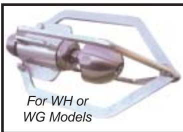
For WH or WG Models

Places the Warthog™ closer to the sewer centerline, for more powerful cleaning of the top wall. It also keeps the nozzle back from blockage, allowing the powerful front jet to do its work. The Super Centralizer bolts to the standard centralizer.