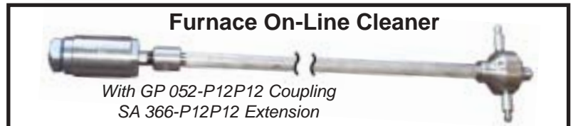
Furnace On-Line Cleaner

With GP 052-P12P12 Coupling SA 366-P12P12 Extension