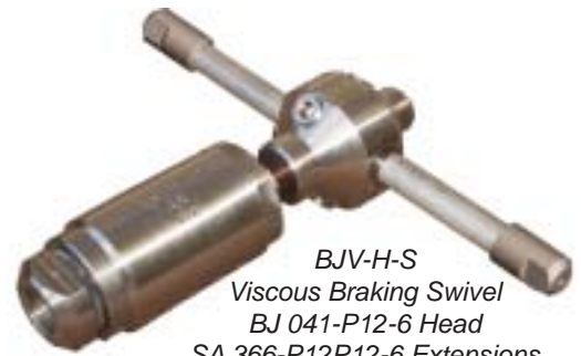
BJV-H-S Viscous Braking Swivel BJ 041-P12-6 Head SA 366-P12P12 Extensions OCL Nozzle Tips