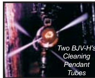
Two BJV-H's Cleaning Pendant Tubes

With GP 052-P12P12 Coupling SA 366-P12P12 Extension