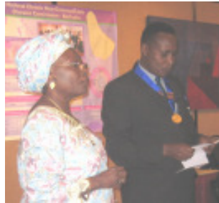
Prof Jacob Kaimenyi (R) with the Minister of Health for Sierra Leone

I wish to draw your attention to agenda item 12.9 of the World Health Assembly that starts tomorrow. The strategic principles mentioned in the report issued by the Executive Board are fully in line with what the Commonwealth Dental Association identified as key areas of action to promote oral health worldwide. Let me first of all stress the importance of an increased integration of oral health into general health.