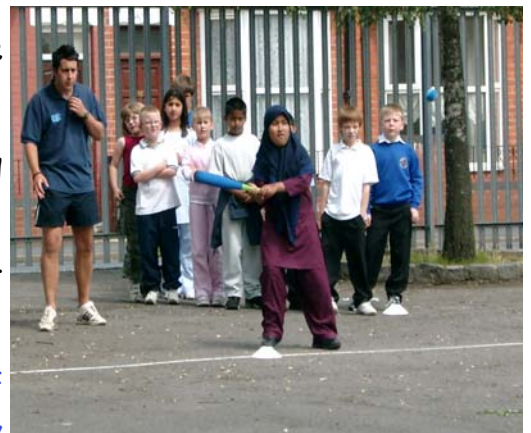
Pupils enjoying a game of rounders!