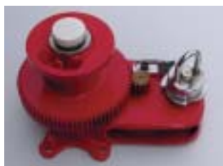
CAPSTAN WINCH - 3,500lb CAPACITY