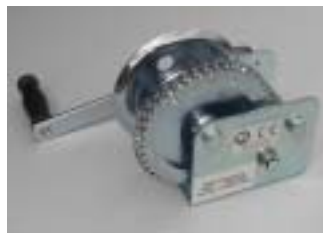
BRAKED HAND WINCH - 1,600lb CAPACITY