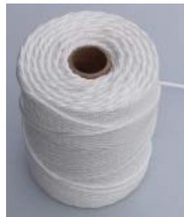
3mm NYLON ROPE - 1kg (Approx. 350m) 4mm NYLON ROPE - 1kg (Approx. 200m)

(We reserve the right to supply alternative items of similar quality.)