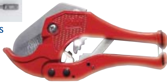
PIPE CUTTERS FOR USE ON PVC WATER/NIPPLE PIPE