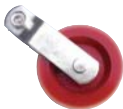
3 1/2" CAST IRON