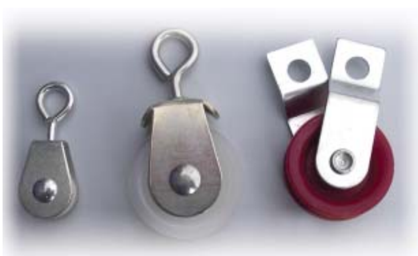
7/8" CURTAIN PULLEY