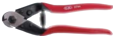
WIRE CUTTERS 190MM LONG - FOR UP TO 6mm WIRE ROPE