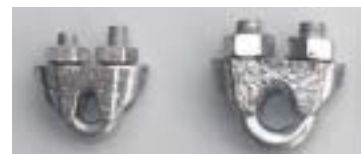
WIRE ROPE GRIPS - 3mm & 5mm