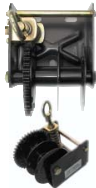
WORM GEAR WINCH - 2,000 & 3,000lb CAPACITY WITH SPLIT DRUM AND LOOP DRIVE