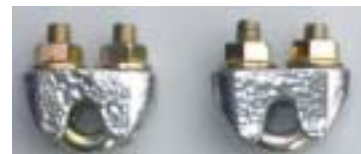
HI QUALITY WIRE ROPE GRIPS - 5mm

(We reserve the right to supply alternative items of similar quality.)