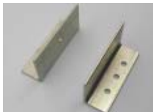
WORM WINCH BRACKET (per pair)