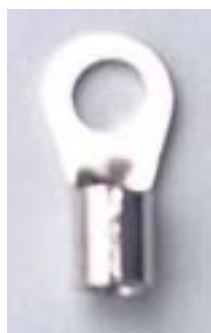
1/8" CLOSED STA-KONS