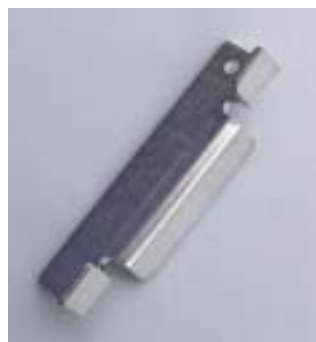
3" CABLE ADJUSTER