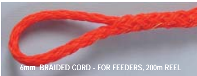
6mm BRAIDED CORD - FOR FEEDERS, 200m REEL