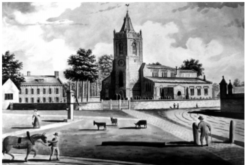
GREAT BOWDEN CHURCH WITH SOUTH FRONT OF OLD RECTORY c.1830.