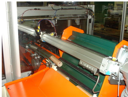
Automatic core feed.