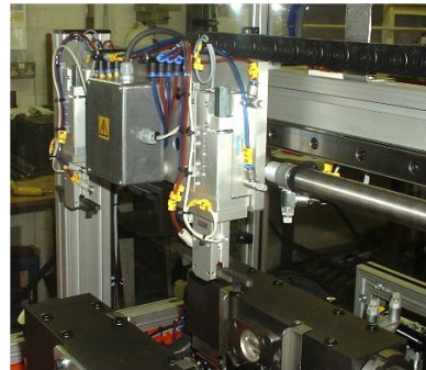
Core pick and place.