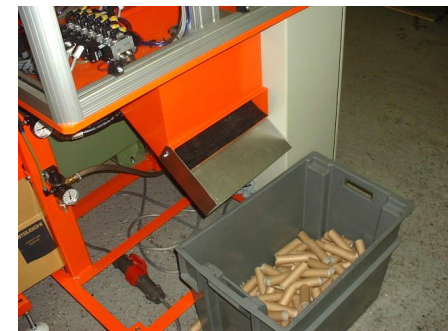
Core collection bin.