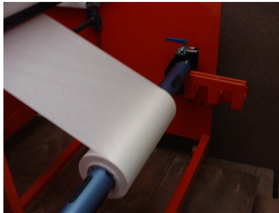
Assisted rear mandrel loading.