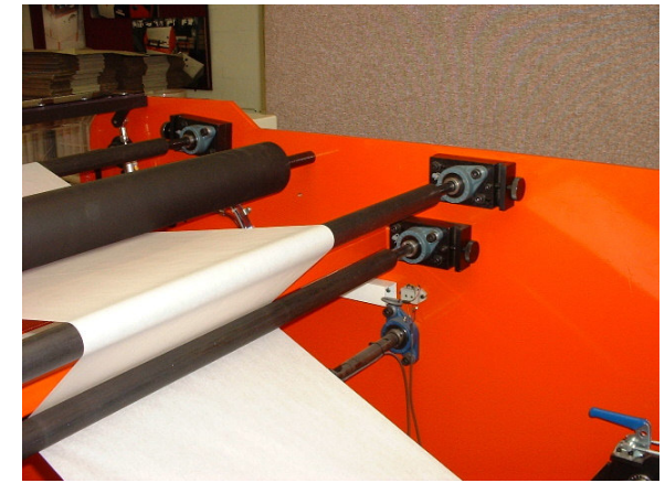
Adjustable tracking rollers.