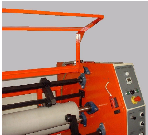
Lightweight front guard.