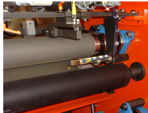
Film break sensor.