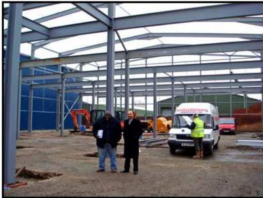
A delighted client and project Architect.