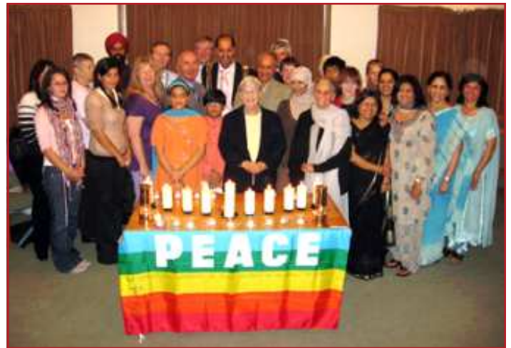
Concord Annual Peace Service October 2006