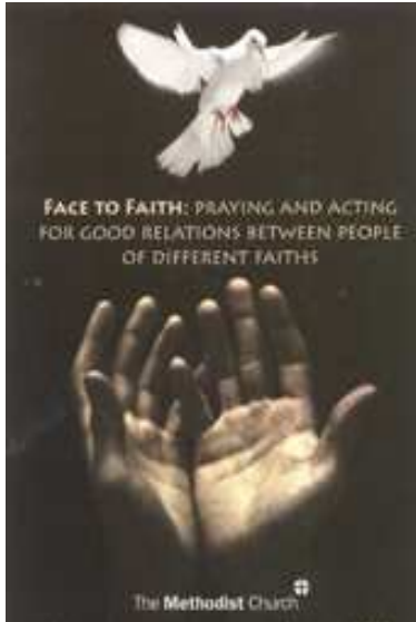
Face to Faith: Praying and acting for good relations between people of different faiths (February 2007)

February 2007 was designated, throughout the Methodist Church, as a special month of prayer and action for improved relationships between different religions. Face to Faith was instigated