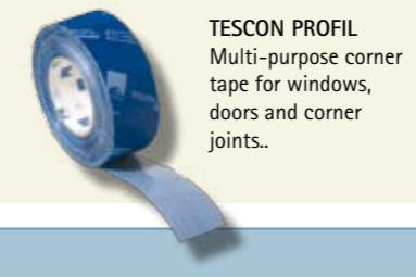
TESCON PROFIL Multi-purpose corner tape for windows, doors and corner joints..

In the second step, simply remove the rest of the release paper and finish sealing.