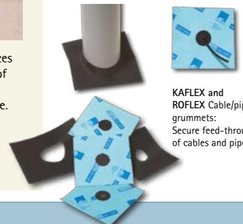
KAFLEX and ROFLEX Cable/pipe grummetts: Secure feed-through of cables and pipes

If pipes or cables penetrate the airtightness layer, they too must be securely sealed. The most suitable means of doing this is with airtightness grummetts made from EPDM. This flexible material allows a tight fit, and KAFLEX is available in all common diameters. Cable grummetts have a self-adhesive. Remove the release paper, push over the cable and stick on. ROFLEX Pipe grummetts are affixed using TESCON No.1. Press firmly to secure the adhesive tape.