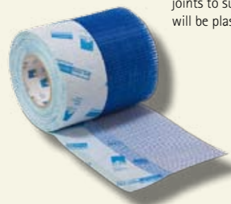
CONTEGA PV Plaster sealing tape for secure, long-lasting joints to surfaces that will be plastered.

For masonry which has yet to be plastered, the plaster sealing tape CONTEGA PV gives a secure, airtight transition. The tape is first attached to the smooth side of the vapour check using its self-adhesive strips.