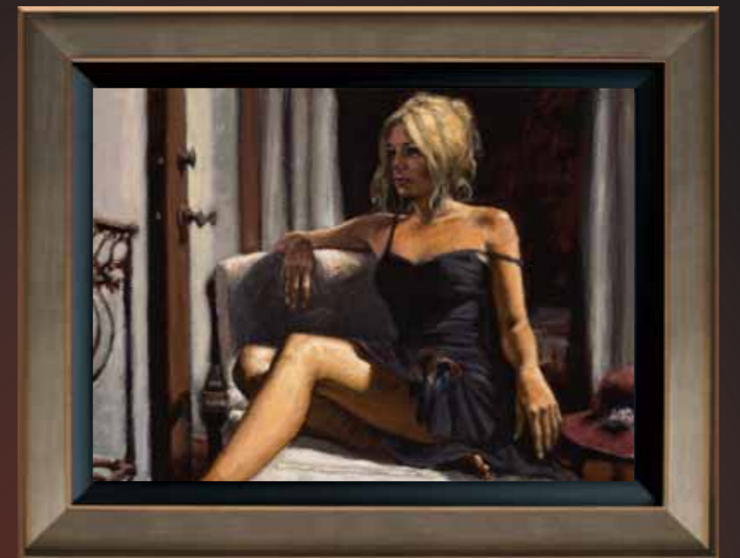
THE RED HAT

Signed Limited Edition Hand Embellished Canvas Edition Size 195 / 20" x 30" / RRP Framed £995