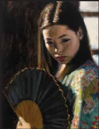
Study for Japanese Girl