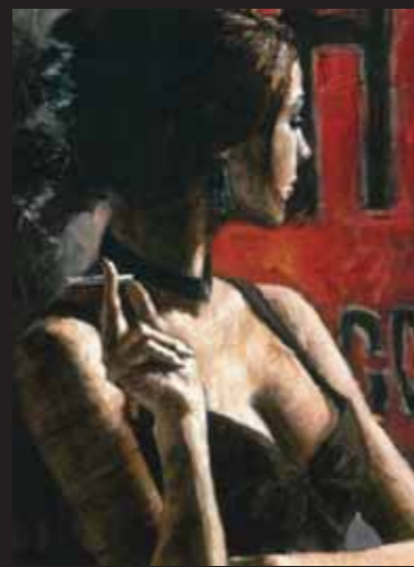
Noches de Buenos Aires II