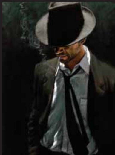
Man in Black Suit III