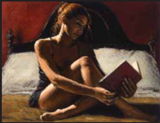
Princess Diaries IV