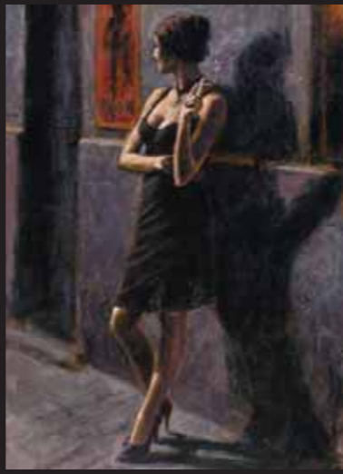
Study for Noches de Buenos Aires II