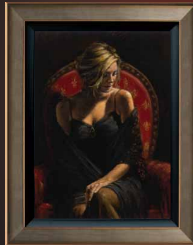
THE BLACK STONE

Signed Limited Edition Hand Embellished Canvas Edition Size 195 16" x 22" RRP Framed £695