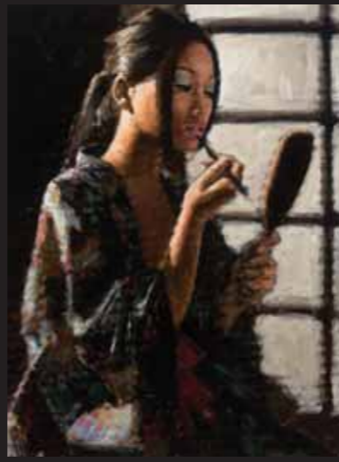
Geisha With Mirror

These superb images are all available as dramatic, high-impact Canvas Editions, with the image measuring approximately 30" x 40"