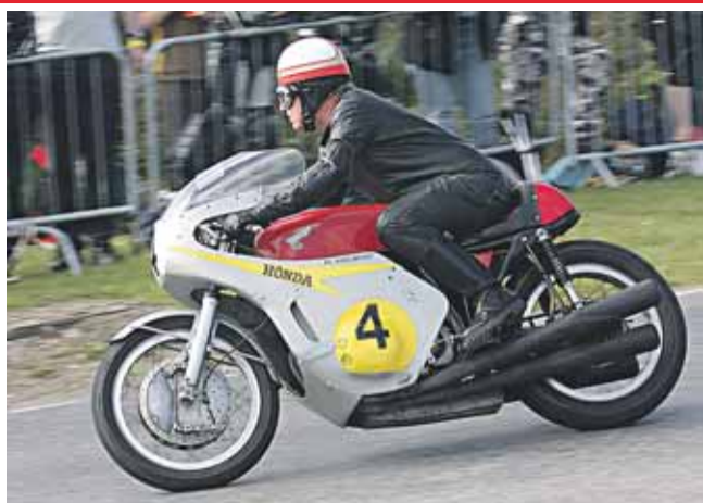
Hailwood's old bike.