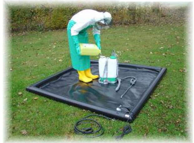
The Spillsave portable bund catches spills allowing safe filling of the sprayer. Suits most spraying systems from knapsack to self-propelled.